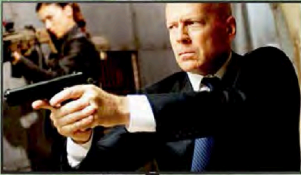
FHD LED TV Series M5100

58" BS1099 (Free Standard wall bracket & installation)